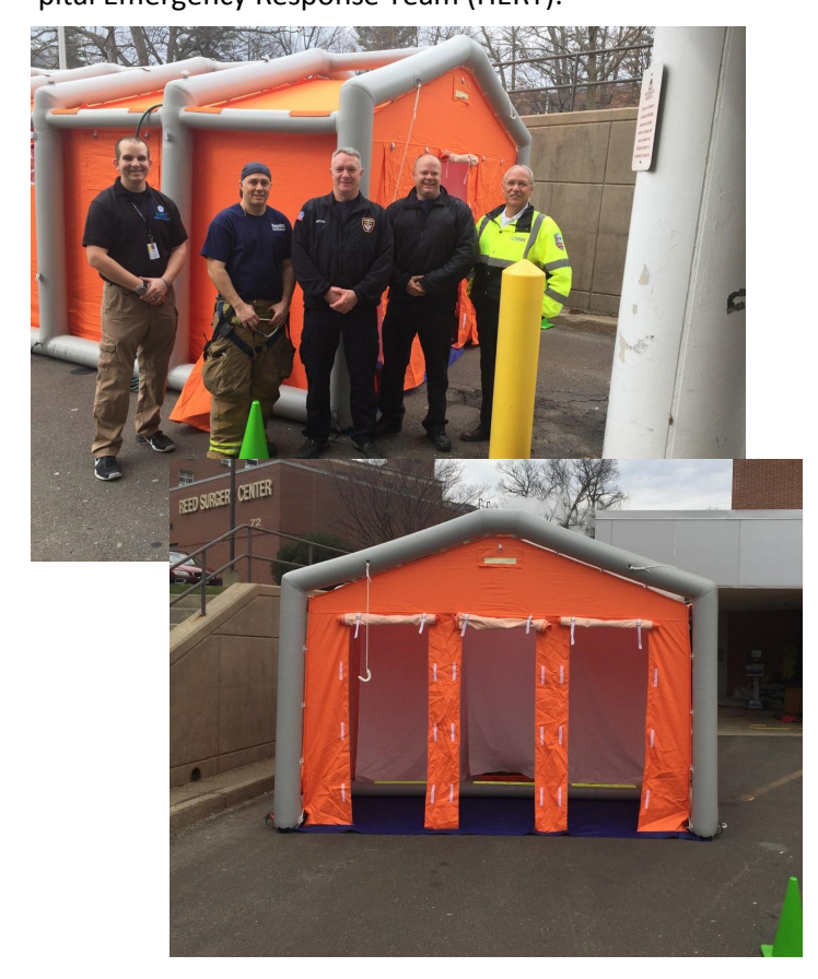
May 24, 2018 —Ebola/Emerging Infectious Diseases Functional Exercise, 9AM—noon in the Emergency Department

On Friday, May 13, 2018, Waterbury Hospital's Emergency Management held a training session going over the setup of its new decontamination system. AMR, Waterbury Fire and Police sent crews over to check out the new tent and how easily it can be setup. From the time we receive your patch, to the time this unit is fully operational, is under 15 minutes. The tent blows up in 3.5 minutes. According to the manufacturer, 104 female, male and non-ambulatory patients can be put through decon in one hour. The tent is fully mobile and has additional options including a portable hot water heater, portable air heater, gray water tank and all of the hose connections to hook it up to a positive water source. Waterbury Hospital's employees will be doing some additional training with FEMA this summer to start up a Hospital Emergency Response Team (HERT).